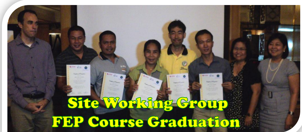
Site Working Group FEP Course Graduation