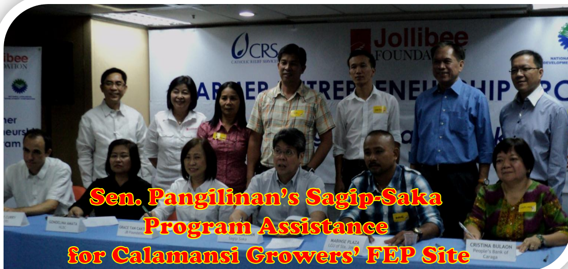
Sen. Pangilinan's Sagip-Saka Program Assistance for Calamansi Growers' FEP Site