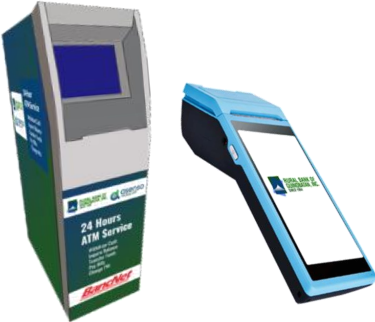
ATM & POS Acquiring