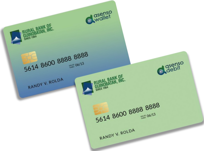
ASENSO Debit & Wallet Card