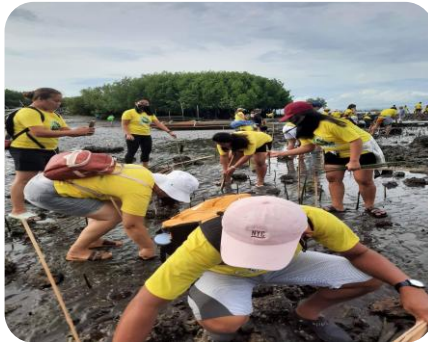
Sampung Desisyon Strategic Goal 4 Environment Policy